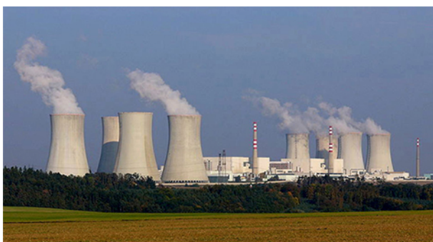
Figure 4.5 The heat exhausted from a nuclear power plant goes to the cooling towers, where it is released into the atmosphere.

Actual heat engines have many different designs. Examples include internal combustion engines, such as those used in most cars today, and external combustion engines, such as the steam engines used in old steam-engine trains. Figure 4.5 shows a photo of a nuclear power plant in operation. The atmosphere around the reactors acts as the cold reservoir, and the heat generated from the nuclear reaction provides the heat from the hot reservoir.